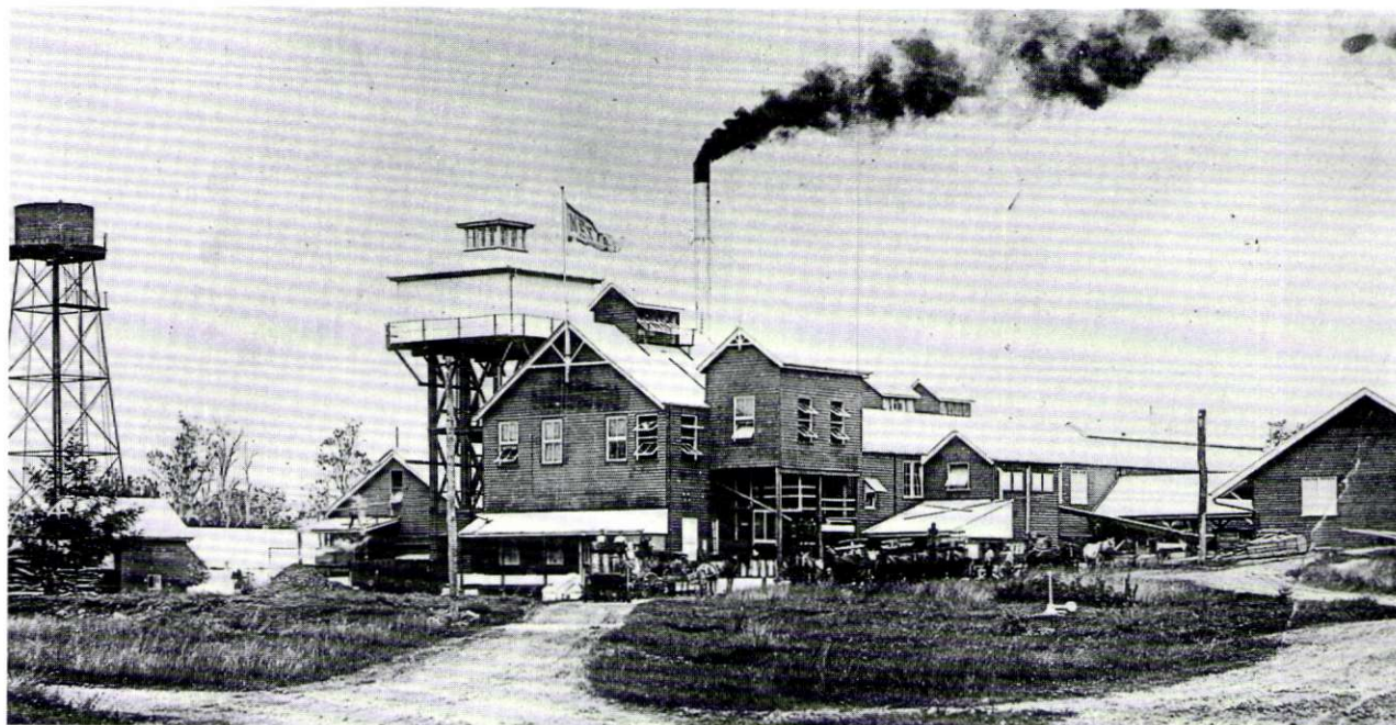
Nestle and Anglo Swiss Condensed Milk Company condensery at Toogoolawah.