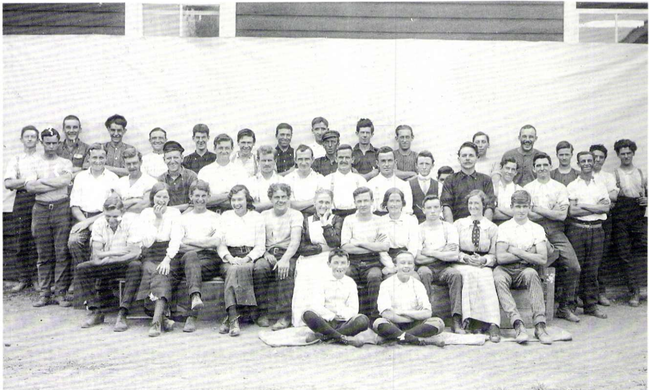
Esk and District Co-operative Society