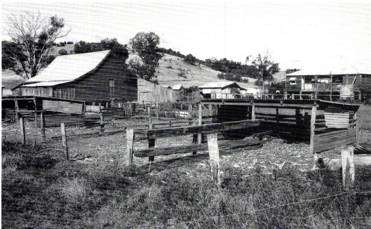
Typical dairy farm buildings on Lowood — Minden Road.