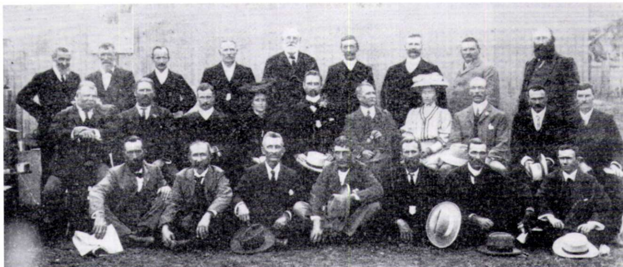
Committeemen and Judges of the Esk Agricultural and Pastoral Society. c. 1915.