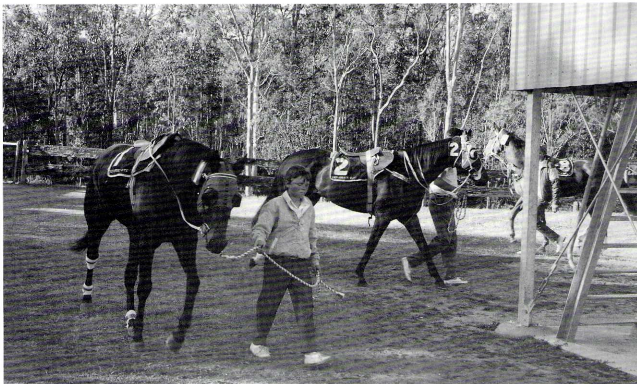
Horses parading at Esk Races. 1987.